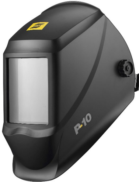
ESAB P-10 Passive Shade 10 Welding Helmet