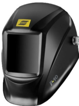
P10 passive helmet front view